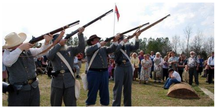
Salute by Honor Guard during Historical Marker dedication ceremony at Refuge Cemetery in Lincoln, AL at the site of the final meeting of the last 2 surviving Alabama Confederates