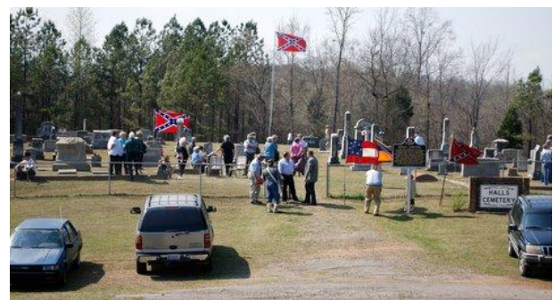
Refuge Cemetery in Lincoln, Alabama