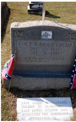
Col. Pleasant "Riggs" Crump's headstone in Refuge Cemetery